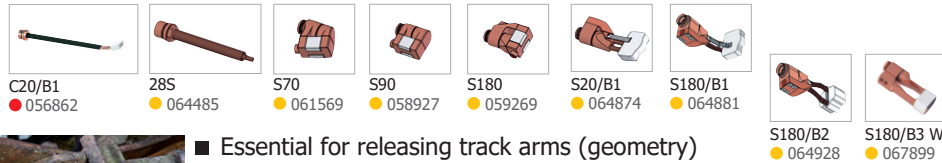
C20/B1 ● 056862 285 ● 064485 S70 ● 061569 S90 ● 058927 S180 ● 059269 S20/B1 ● 064874 S180/B1 ● 064881 S180/B2 ● 064928 S180/B3 W ● 067899