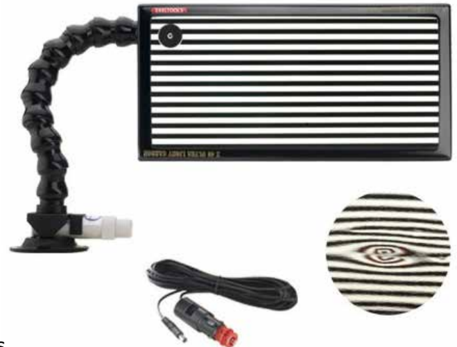
Supplied with a cigarette-lighter lead (4.5 m)