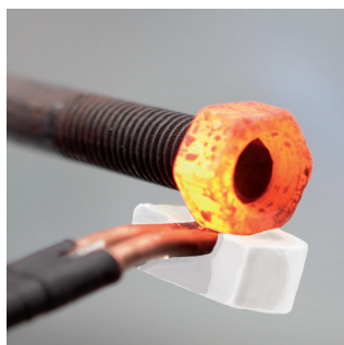
Releasing of rusted bolts