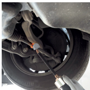
Releasing of steering linkage