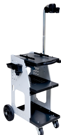
ref. 051331 + 052284 UNIVERSAL 800 + Over hanging arm