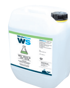
ref. 062511 Welding coolant - 5 l