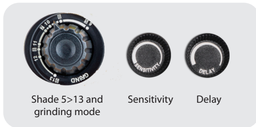
Shade 5 > 13 and grinding mode